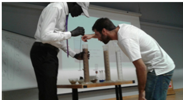
Soil analysis demonstration in class