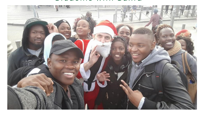
Students with Santa