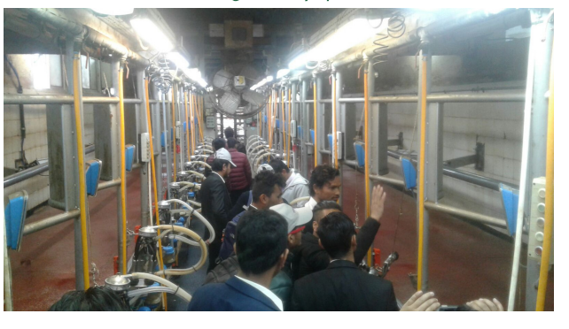
4. Dairy farm food nutrition