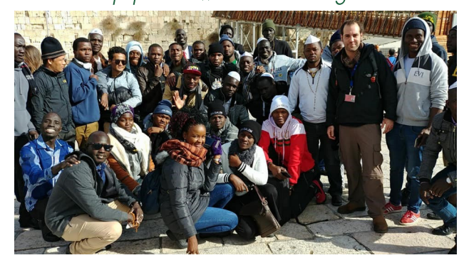
Group photo with the tour guide