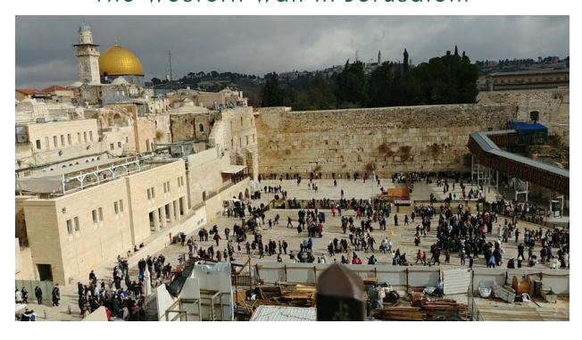
The western wall in Jerusalem