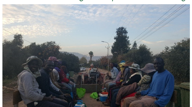
Students returning after practical training