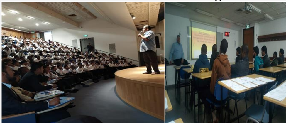
General safety training

Each student undergoes general safety training at the beginning of the year.