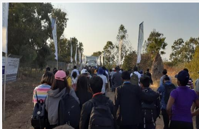
During the exhibition

The last station to our tour was an agricultural exhibition held every year at the Ein Harod Spring park.