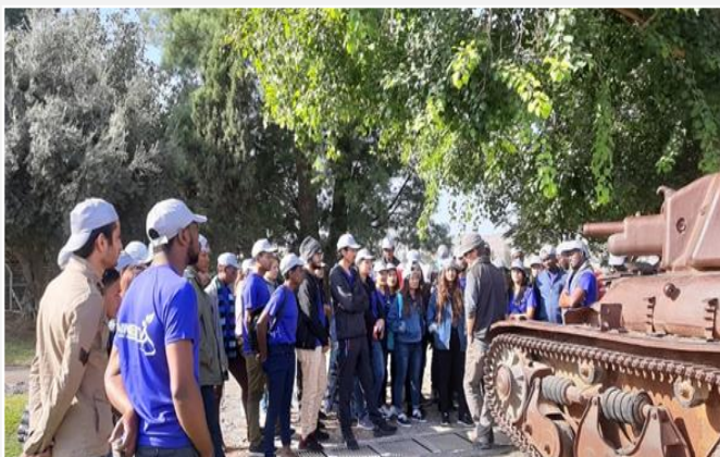
The Tank of Degania

Degania's tank has become a symbol in the history of the State of Israel. It has entered history as a symbol of an act of heroism in the defensive battle of the few against the many, of human ability in the face of steel and of the determination of the settlers in defending their home. The Syrian tank is in the place where it was stopped in the War of Independence and serves as a monument.