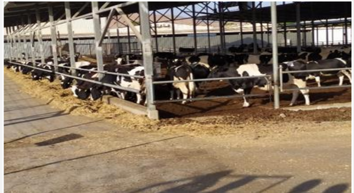
Dairy farm - shed

Degania's tank has become a symbol in the history of the State of Israel. It has entered history as a symbol of an act of heroism in the defensive battle of the few against the many, of human ability in the face of steel and of the determination of the settlers in defending their home. The Syrian tank is in the place where it was stopped in the War of Independence and serves as a monument.