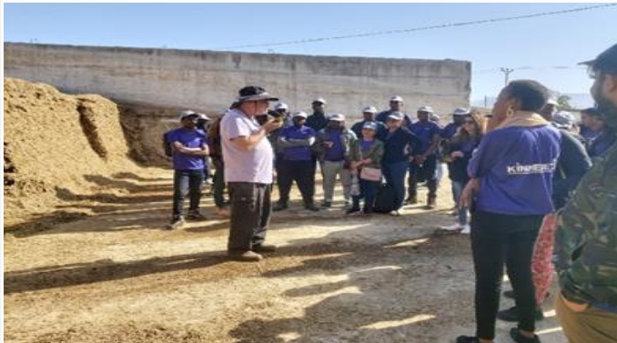
Dairy farm – food preparation

Our second tour took place in Jordan valley area. We visited Dairy farm, tomato and cucumber greenhouses, grafted Avocado trees nursery, dairy waste treatment facility, Yardenit holy site for Christians, Banana plantation and the famous Tank of Degania (the first kibbutz in the world!).