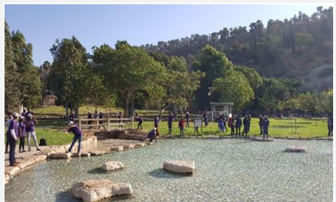
In the park