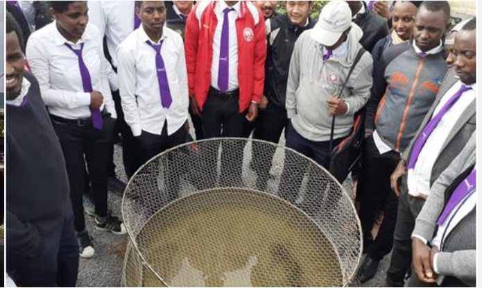
At the meteorology station