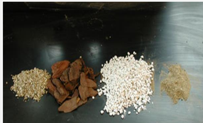
Different media type