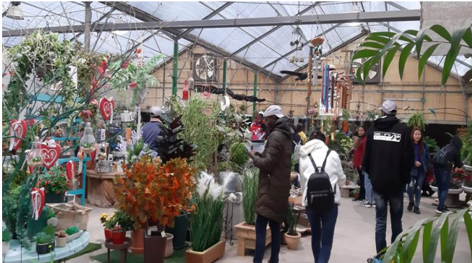
Flower and plant nursery