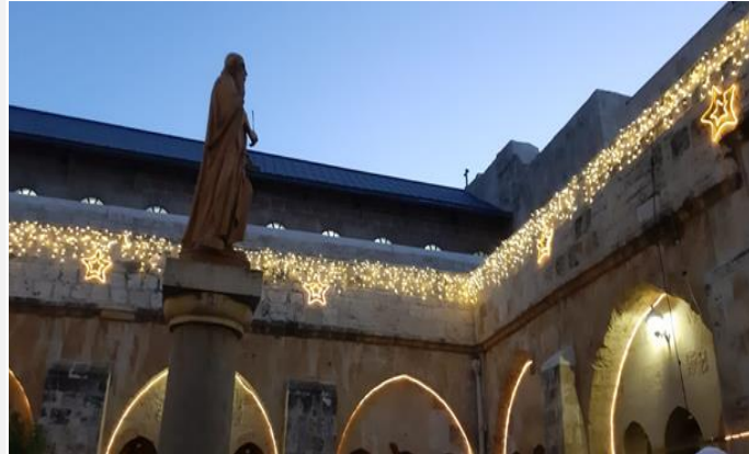
At the Big Mass