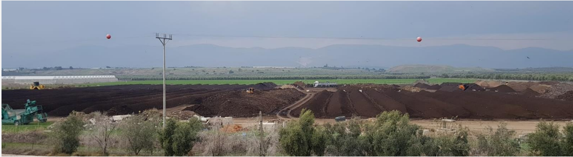
Compost production site

Our third tour took place in Spring valley area. We visited compost preparation site, vitsa point, nursery, fish ponds: