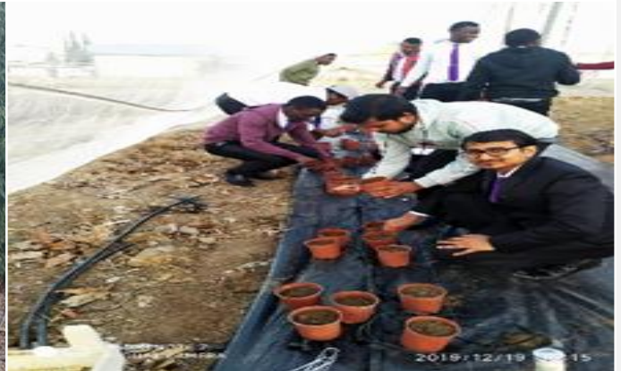
Quinoa fertilizers research