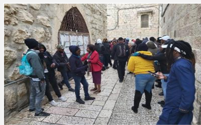
At the old city