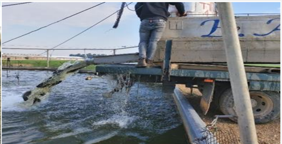
Transferring fish to small pond