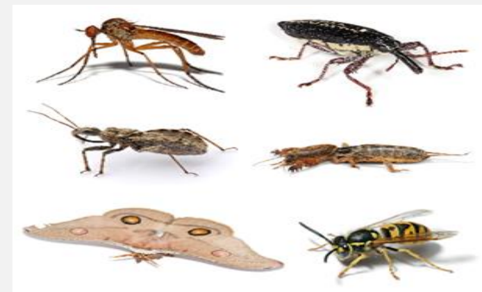
Pests and natural enemies

Students started new topics in class: Plant propagation, Aquaculture, plant control and open field crops.