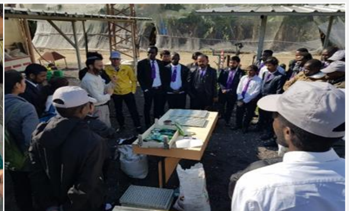
During the explanation